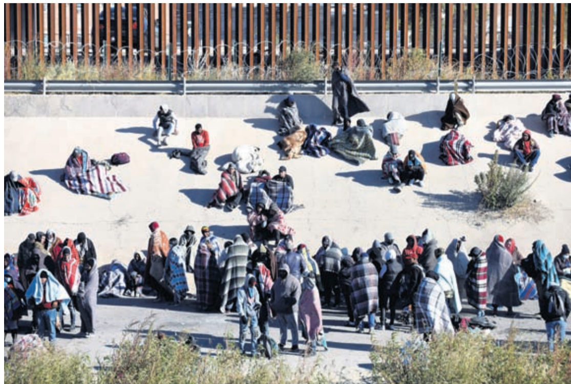
Migrants wait to cross the US-Mexico border from Ciudad Juárez, Mexico, Wednesday, Dec. 14, 2022.

But the seven-page document dated Tuesday included no major structural changes amid unusually large numbers of migrants entering the country. More are expected with the end of Title 42 authority, under which migrants have been denied rights to seek asylum more than 2.5 million times on grounds of preventing spread of COVID-19.